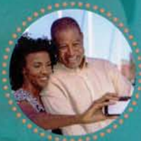
And In Between