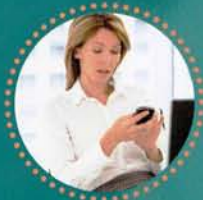
See Up Close